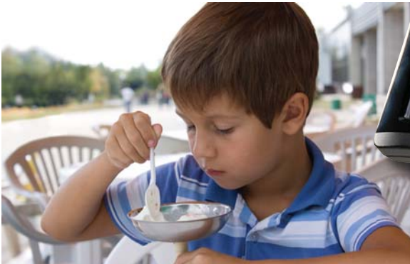
Quick Service Restaurants / Ice Cream Parlors