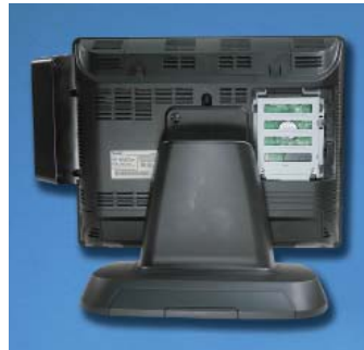
Tool-Free Access To The Hard Disk Drive