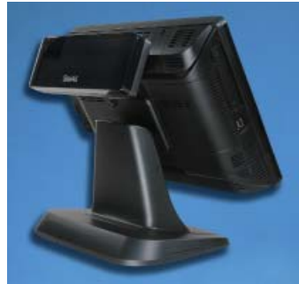
Optional Integrated VFD Customer Display