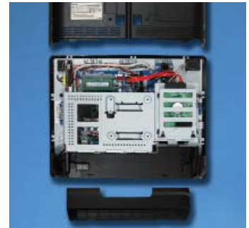
Easily Open The Back To Access RAM And Optimize Serviceability