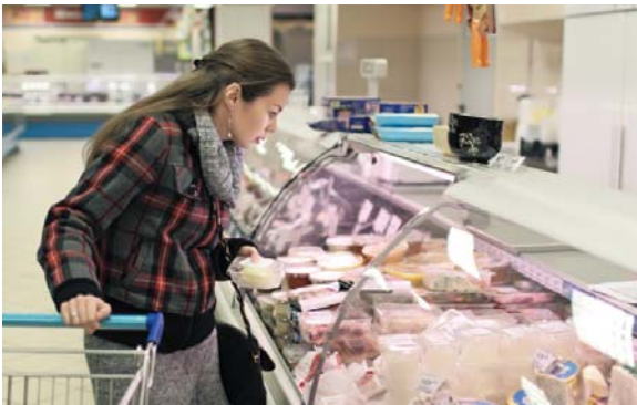
Grocery Stores / Convenience Stores