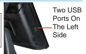
Two USB Ports On The Left Side