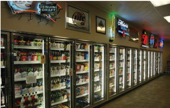
Retail Stores / Liquor Stores