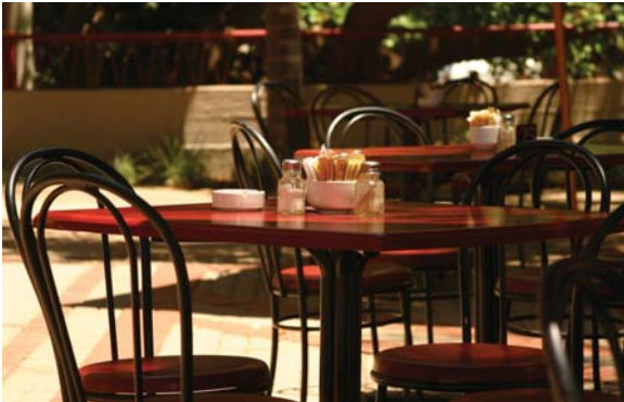
Table Service Restaurants